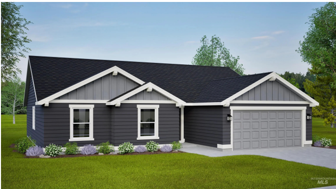
KEIZER 3 BEDROOMS | 2 BATHROOMS | 1692 SQUARE FEET

At 1692 square feet, The Keizer is a mid-size home that makes the most of its single-story layout. This thoughtfully designed space begins as you enter the home with a convenient coat closet off the entryway. From there, youâ€™re welcomed into the main living space by stunning vaulted ceilings, where youâ€™ll find the great room, dining room, and kitchen featuring an oversized island with seating and a large pantry. The vaulted ceiling continues into the private main suite, where youâ€™ll find a dual vanity bathroom and spacious walk-in closet. On the other wing of the home lives the shared bathroom and two additional bedrooms, each with generous walk-in closets. ** Limited Time Savings! â€“ Get up to $25K on presale homes. Offer ends 9/31/25. Contact us to learn more. **